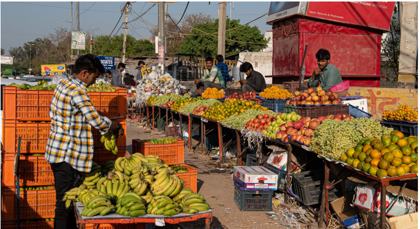
A weekly market in South Delhi.